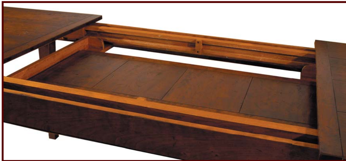
LEAF STORAGE INSIDE THE TABLE

PERHAPS THE BEST FEATURE IS THAT THE LEAVES STORE NEATLY INTO THE TABLE WHEN NOT IN USE.