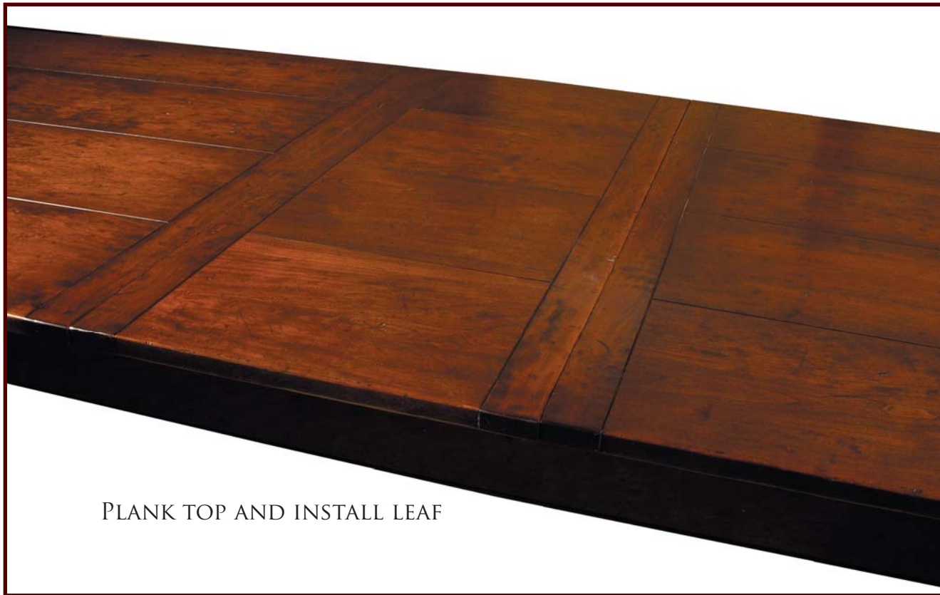
PLANK TOP AND INSTALL LEAF

D.R.DIMES English Collection OLD WORLD CRAFTSMANSHIP SINCE 1964