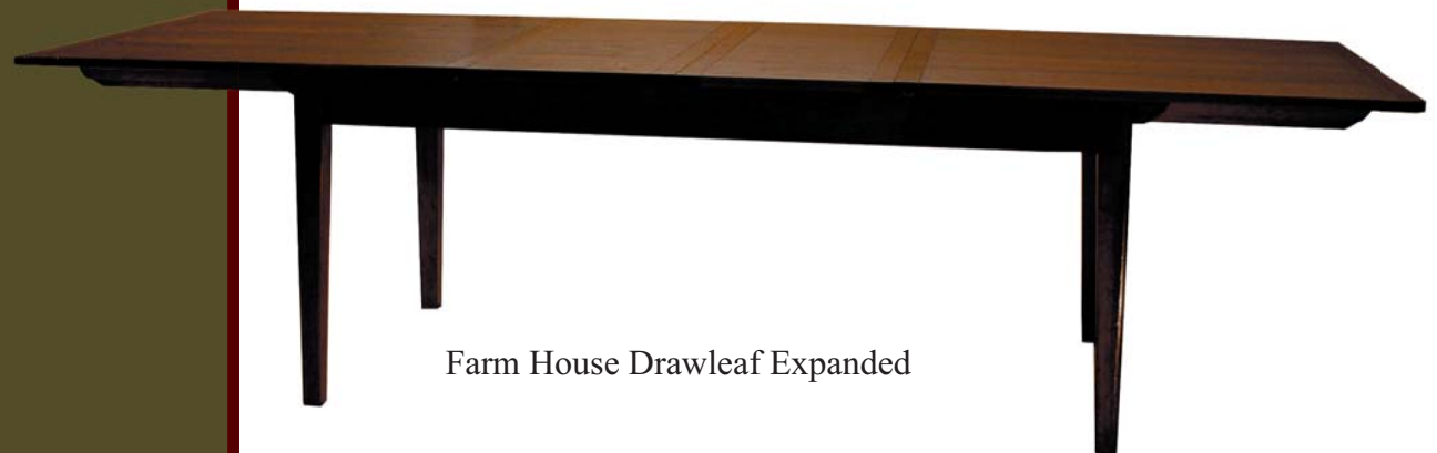
Farm House Drawleaf Expanded