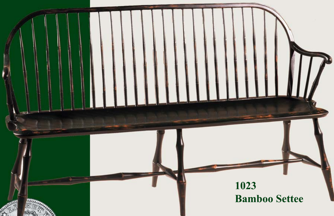
1023 Bamboo Settee

Height 36" Width 64" Seat Depth 16" Seat Width 61"